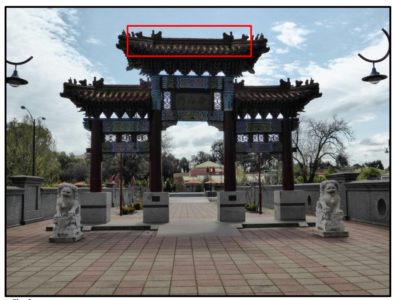
Fig. 2 Acari University Paifang circa 2020.

COMMENT: All samples pulled from top structure of Paifang showed considerable wear easily attributable to the Formosan Termite. Specified location of wood removal indicated in Fig. 2.