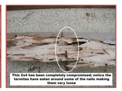
Fig. 1a – 1c: Wood removed from Acari University Paifang after Mandy Pepperidge's Death 9/2022

COMMENT: All samples pulled from top structure of Paifang showed considerable wear easily attributable to the Formosan Termite. Specified location of wood removal indicated in Fig. 2.